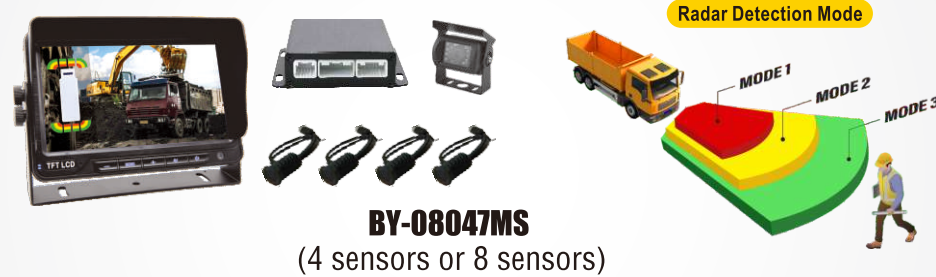
BY-08047MS (4 sensors or 8 sensors)