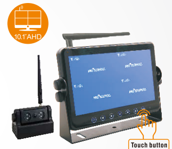
BY-08104WR(4QUAD) Camera optional: 1PC 2PC 3PC 4PC