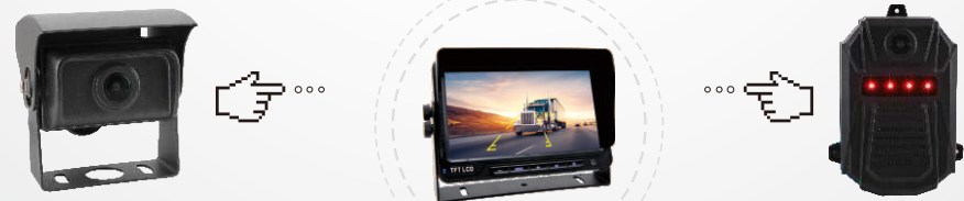
BY-02046 warning, camera, two function in one