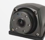
BY-02032 (AI) AHD 720P