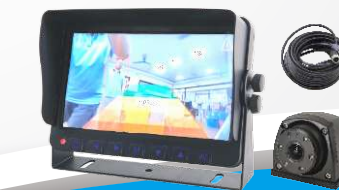
BY-08477MS (AI camera)